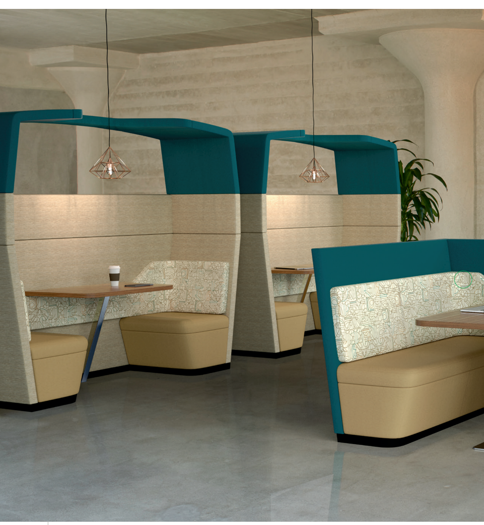
#6520-65TL-PB1 Public Love Seat Models with Integrated Tables Featuring Power Band 1 Units and #6513-65TS Private Lounge with Partial Canopy Models, also with Integrated Tables