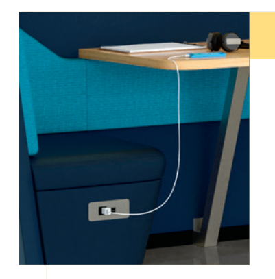
Convenient power options make it easy to plug-in and recharge.