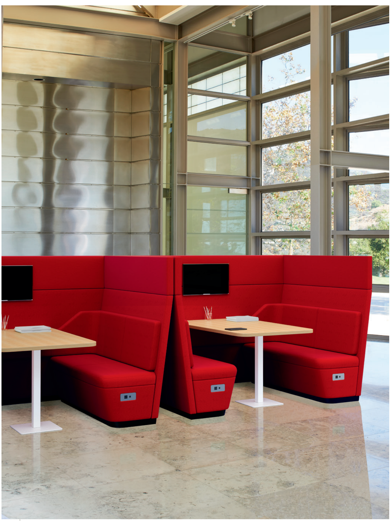
#6521-65TL-PB1 Private Love Seat Models with Integrated Tables and Seat-Mounted Power Band 1 Units