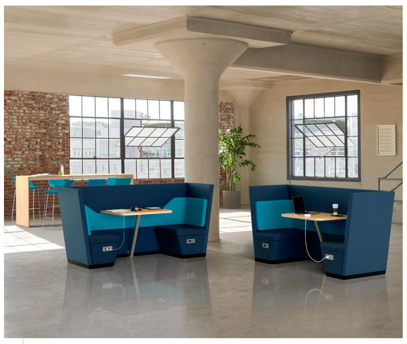
#6510-65TS-PB1 Public Lounge Models with Integrated Tables and Seat-Mounted Power Band 1 Units